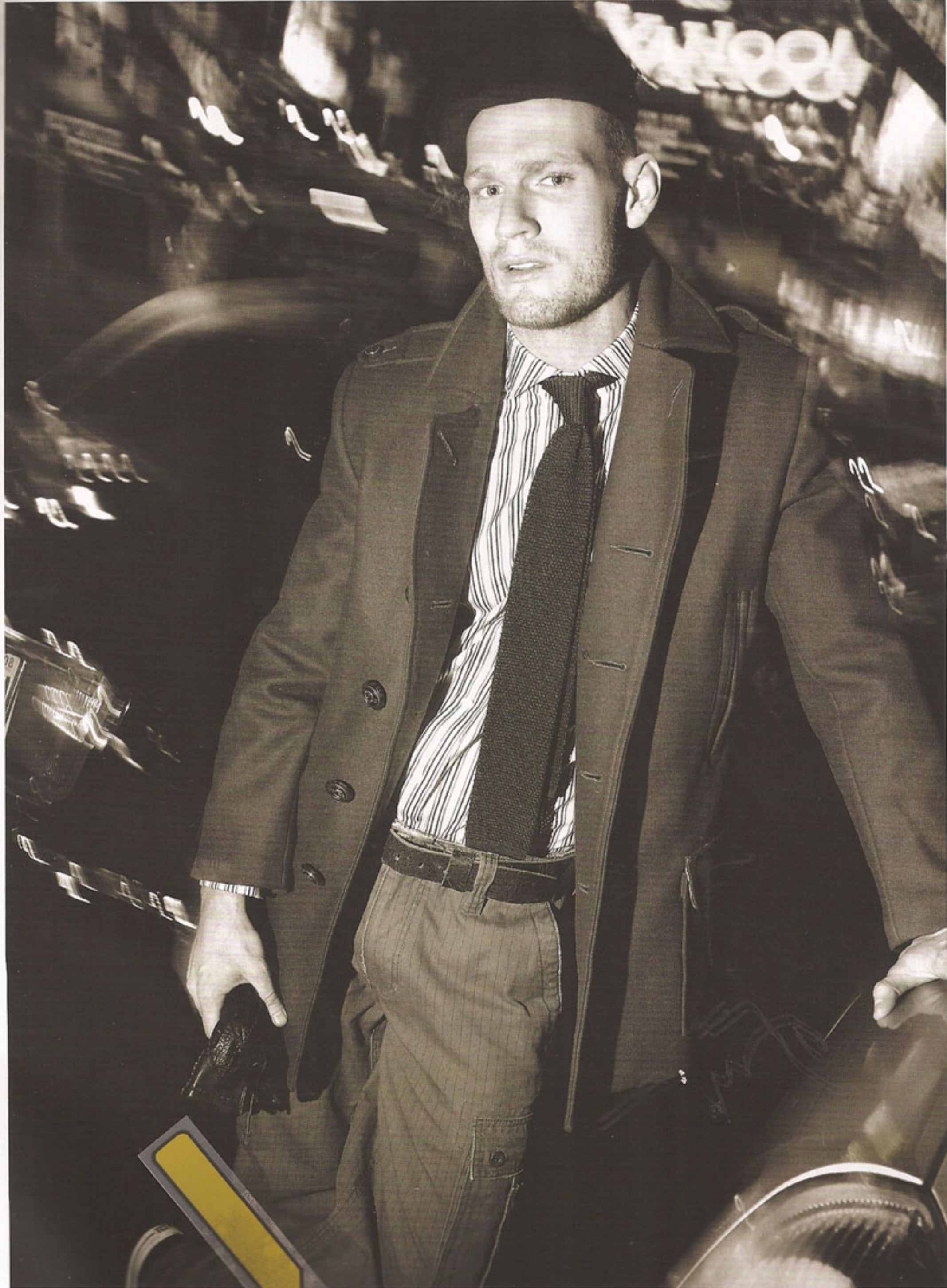
Opposite page: Makins Hats cap, Wellenstep peacoat, Tommy Bahama shirt and belt, Izod trouser, Rothco boots. This page: David Steele by Albrizio cap, Jib Hunt coat, Mel Gambert shirt, Gitman Bros. tie, Wearfirst pants, Kale Miles belt, Hiltz Willard gloves.