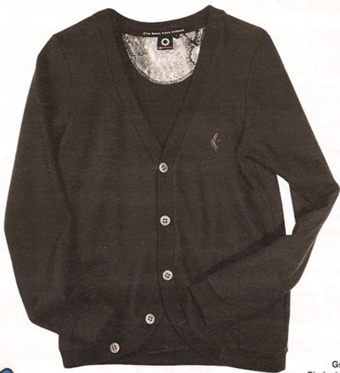
Gsus Sindustries cotton iddiamin cardigan: $120