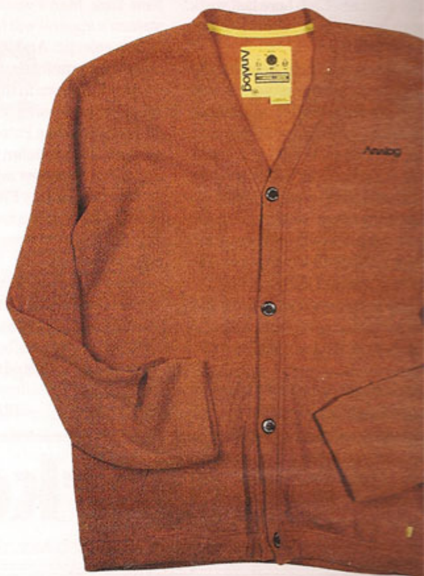
Analog cotton, slim-fit Tutor cardigan: $70